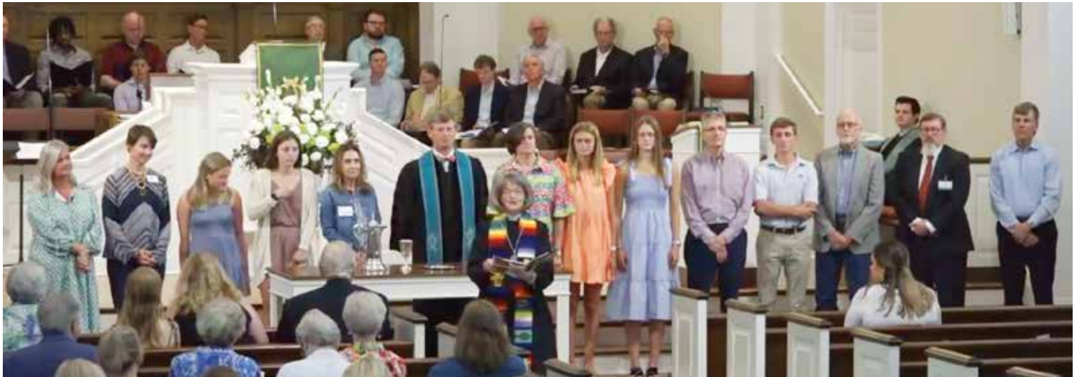
The mission trip teams to Ghana and Mexico were commissioned before their respective trips.