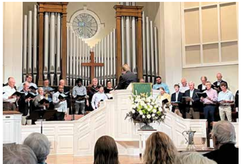
A GPC tradition, the men of the church sang as a choir on Father's Day, June 18.