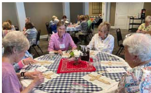
Enjoying the craft at Indoor Picnic at the PW Gathering in June.