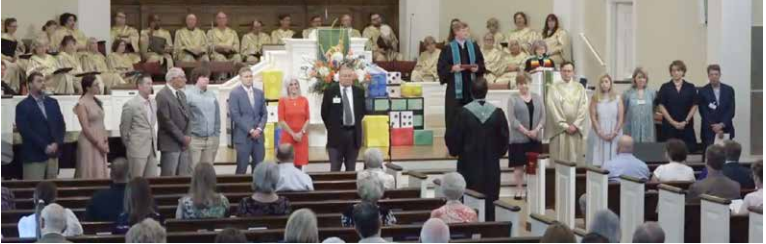
The Class of 2026 Elders and Deacons were installed on June 11